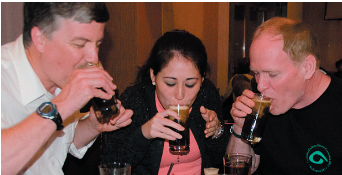
Three (random) New CCE Conventioneers celebrate 'last call' at the hotel bar on Sunday night.

Go to youtube.com and search for "car bombs at CCE 2013" for round two -- it's a photo finish!