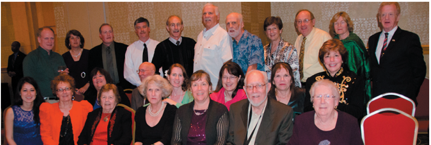
Attendees at the 2013 CCE Convention in Washington D.C.